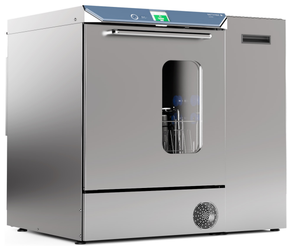
815 LX with side chemical cabinet (accessory)