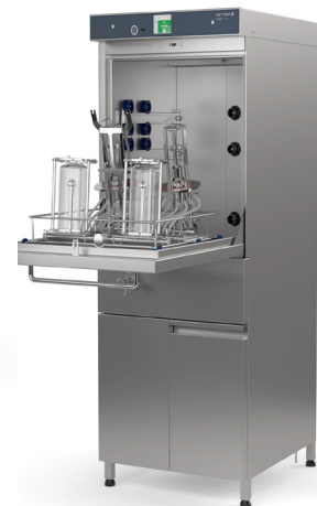
Getinge Lancer Ultima model 910 LX freestanding labware washer