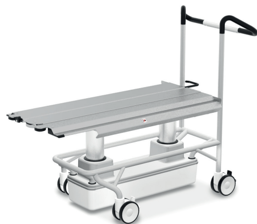
Smart adjustable-height trolley for sterilizers