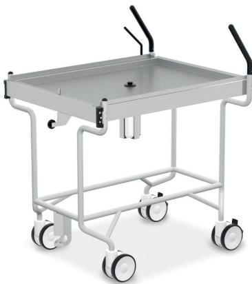
Smart fixed-height trolley for washer-disinfectors