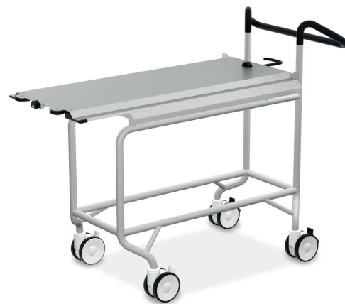
Smart fixed-height trolley for sterilizers