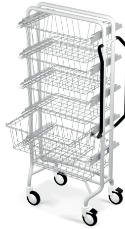
DTO single SPRI (5 high) Item no.: 564718170 (Baskets not included)