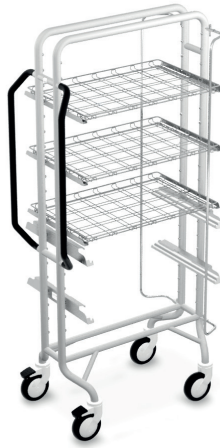
DTO single (mixed) Item no.: 564718370