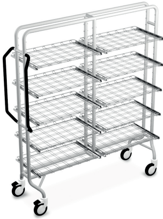
DTO double (shelves) Item no.: 564718970