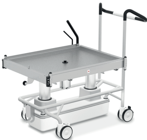
Smart adjustable-height trolley for washer-disinfectors

Significantly reduced strain by enabling moving and maneuvering of trolleys to the desired position with little effort.