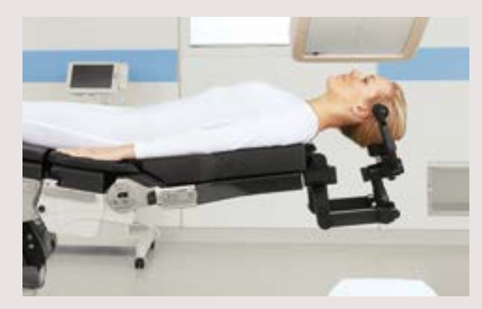
Radiolucent accessories – such as the skull clamp for neuro and spine procedures – are designed for compatibility with intraoperative imaging.