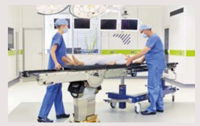
The dedicated table top of the Maquet Magnus Surgical Table supports repositioning-free transfer to the MRI.