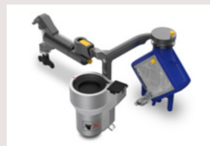
Compact Holder with Fixation Point, Rotaflow II Drive and the PLS module combines the components in one ergonomic holder concept.