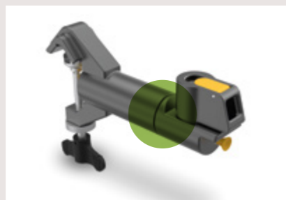
Fixation Point attaching the Compact Holder to a standard rail (vertical or horizontal) or a vertical round pole, such as on a mast.