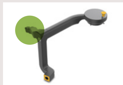
Compact Holder can be attached to the left or the right side of the Rotaflow II device handle or to the Fixation Point.

Electrical interface for transmitting alarms to external systems, such as nurse call. Ethernet network connection and RS232 serial interface transmit application and device data to external systems.