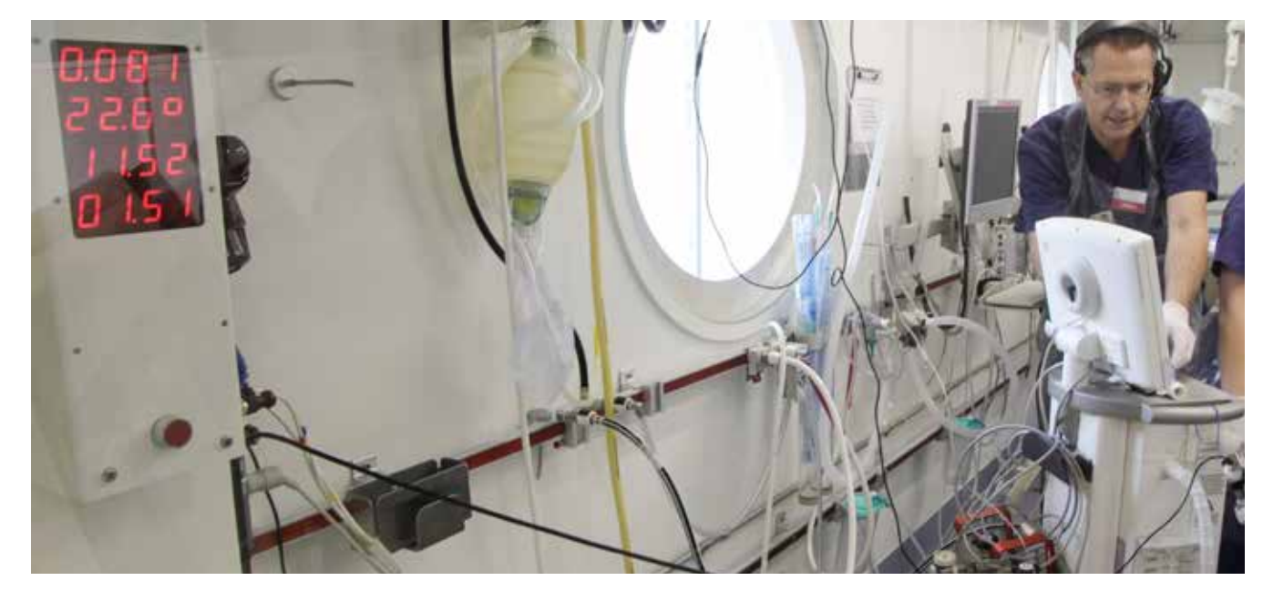
Action at 11,52 m depth in the multiplace chamber

This is about the most severe patient category to be found in the ICU, where we need to optimize ventilation during a number of other ongoing treatments and interventions.