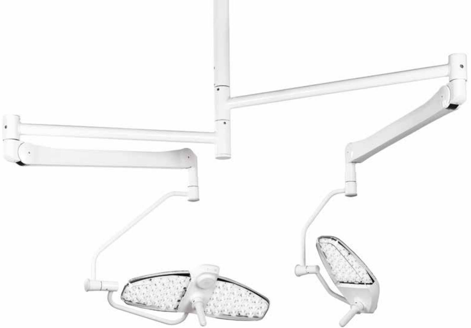
Maquet Lucea 100/50