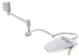
Maquet Lucea 50: wall version