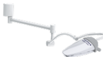
Maquet Lucea 40: wall version