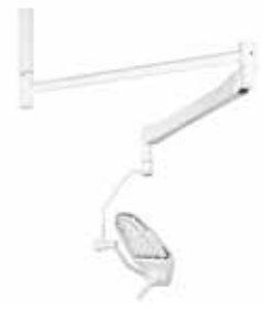
Maquet Lucea 50 DF: ceiling version