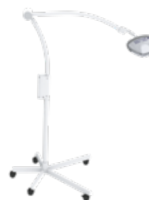
Maquet Lucea 40: mobile version