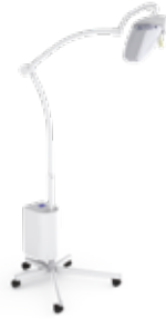
Maquet Lucea 50: mobile version with battery