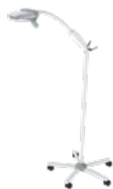
Maquet Lucea 10: mobile version