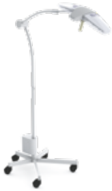
Maquet Lucea 100: mobile version