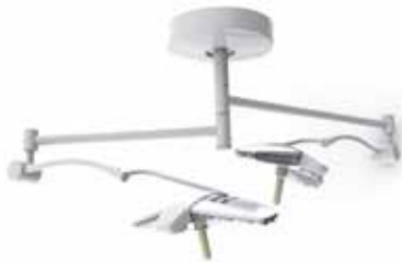
Dual Maquet Lucea 100: ceiling version