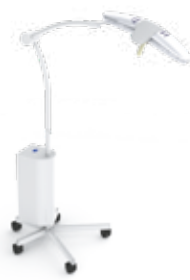
Maquet Lucea 100: mobile version with battery