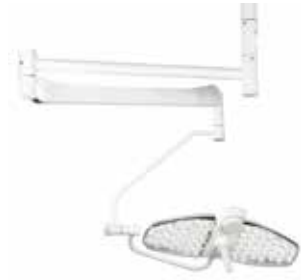
Maquet Lucea 100 DF: ceiling version