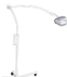
Maquet Lucea 40: ceiling version