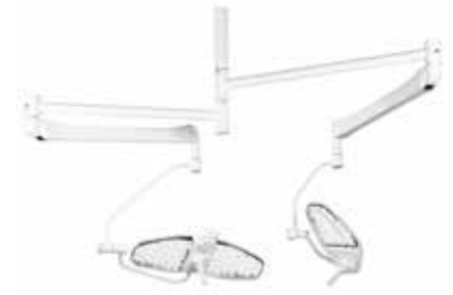
Dual Maquet Lucea 50/100 DF: ceiling version