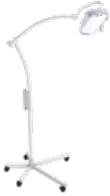
Maquet Lucea 50: mobile version