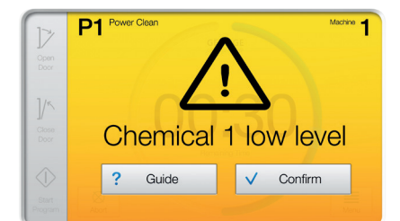
Every triggered alarm comes with clear on-screen directions for what action to take.