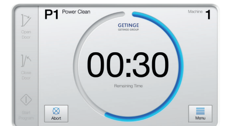
Status at a glance: easy-to-see the time remaining, even from a distance.

Large 7-inch high-resolution screens are easy-to-read and monitor, even at a distance. These screens display the most critical process information clearly and logically, including remaining cycle time and start-up selections.