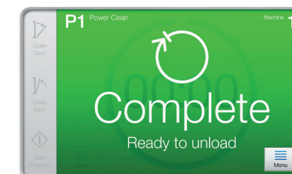
The user interface provides clear, uncluttered information — only what you need at any particular stage, nothing more.