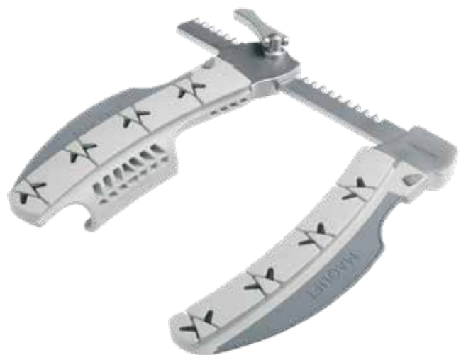
Activator II Drive Mechanism