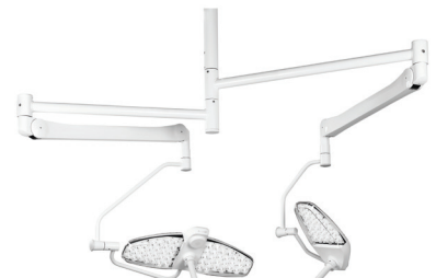
Dual Maquet Lucea 50/100 DF: ceiling version