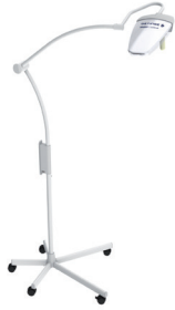
Maquet Lucea 50: mobile version