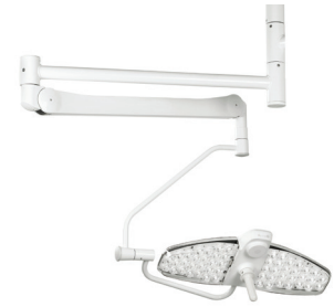
Maquet Lucea 100 DF: ceiling version