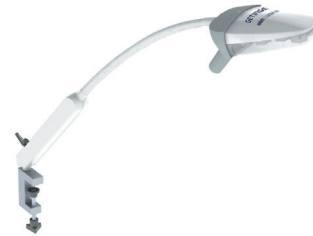
Maquet Lucea 10: rail version