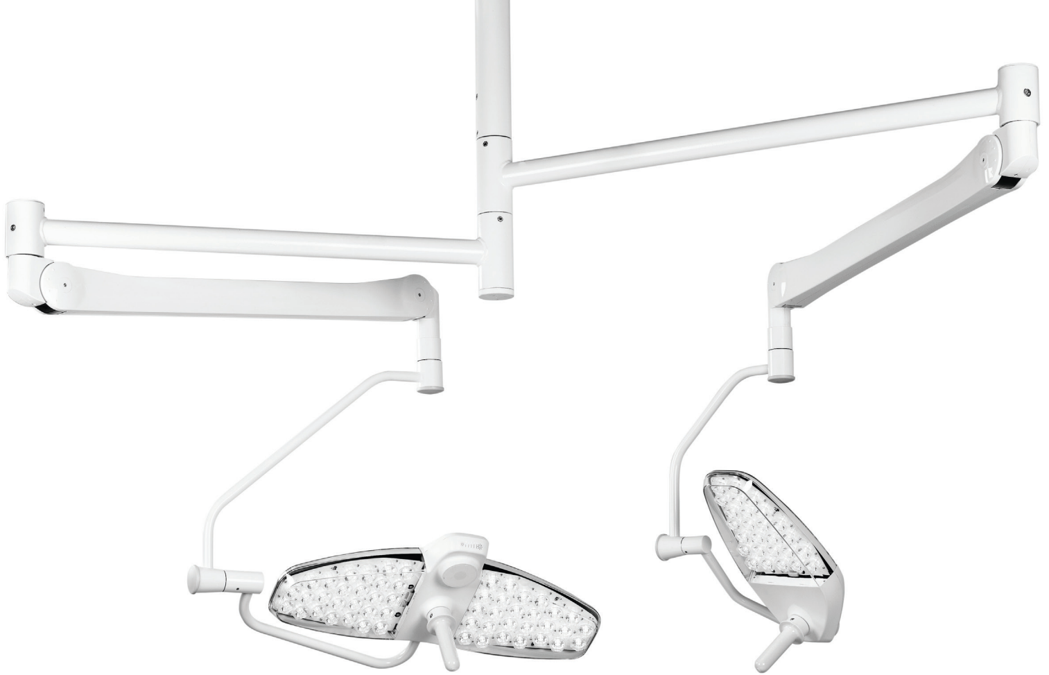
Maquet Lucea 100/50