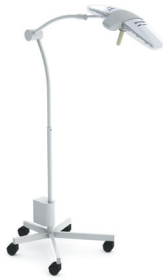
Maquet Lucea 100: mobile version