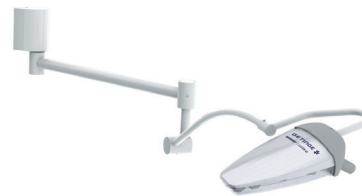
Maquet Lucea 40: wall version