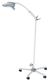
Maquet Lucea 10: mobile version