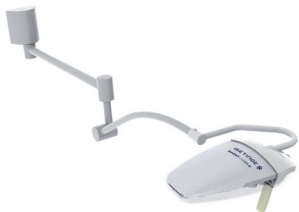
Maquet Lucea 50: wall version