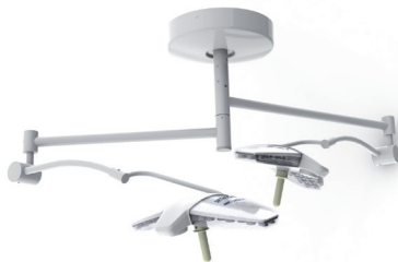
Dual Maquet Lucea 100: ceiling version