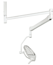
Maquet Lucea 50 DF: ceiling version