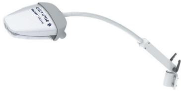
Maquet Lucea 10: wall version