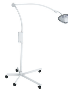
Maquet Lucea 40: mobile version