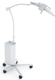
Maquet Lucea 100: mobile version with battery