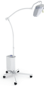
Maquet Lucea 50: mobile version with battery