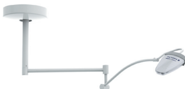
Maquet Lucea 40: ceiling version