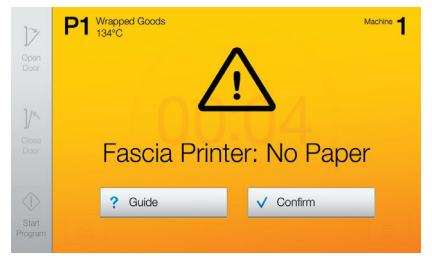
Solve problems or access advanced features directly from the clear, easy-to-understand user interface.

The user interface provides clear, uncluttered information – only what you need at any particular stage, nothing more.