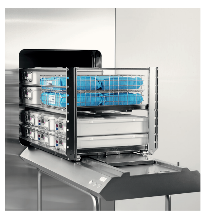
Automatic loader and unloader for shelf racks (GL64SR).