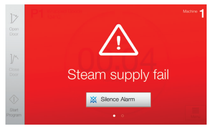
Every triggered alarm comes with clear on-screen directions for what action to take.