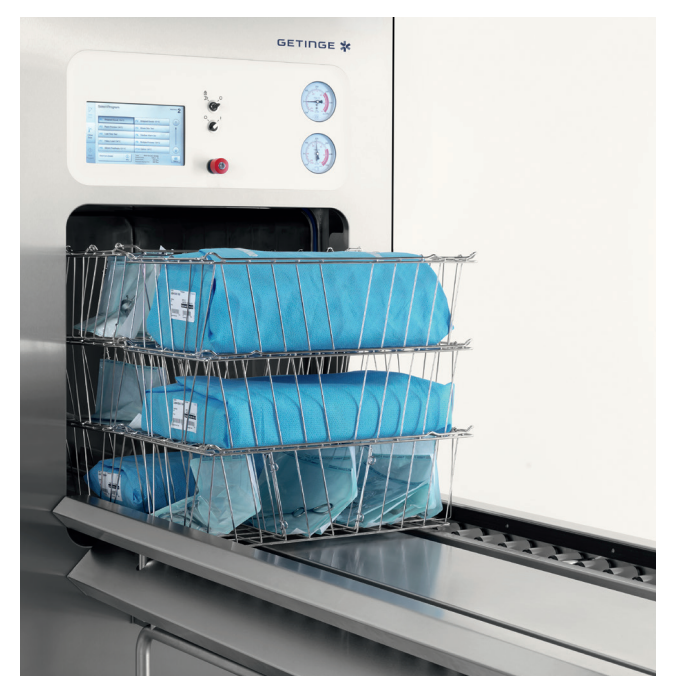
Automatic loader and unloader for baskets (GL64B).