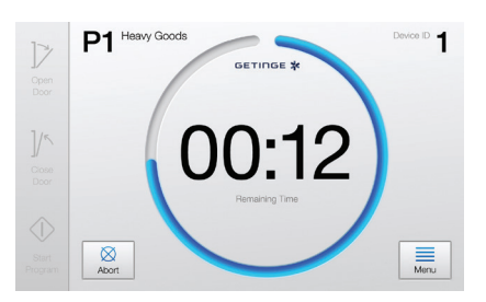
Status at a glance: easy to see the time remaining, even from a distance.