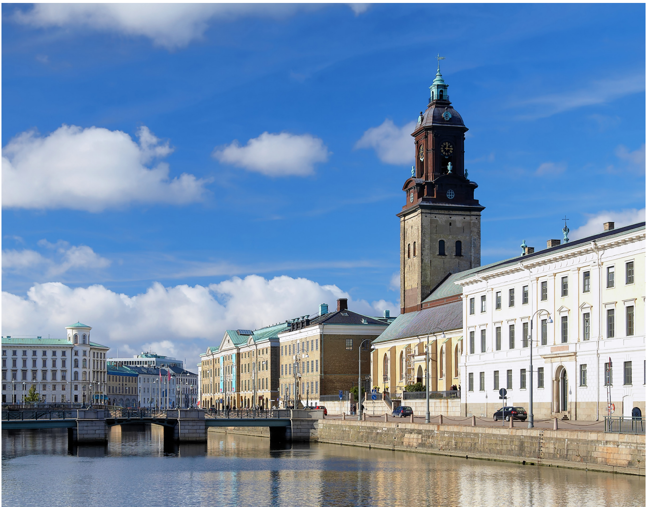
Sahlgrenska University Hospital resides in Gothenburg.

anesthesia machine to ventilate their high-risk patients. This is an account of how one of these centers made the decision to choose Flow-i and how they view that decision today.