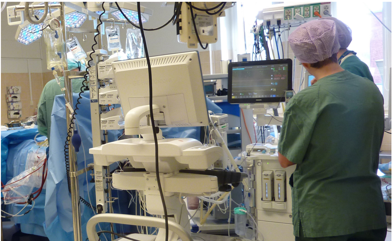
One of the operating rooms at Sahlgrenska University Hospital